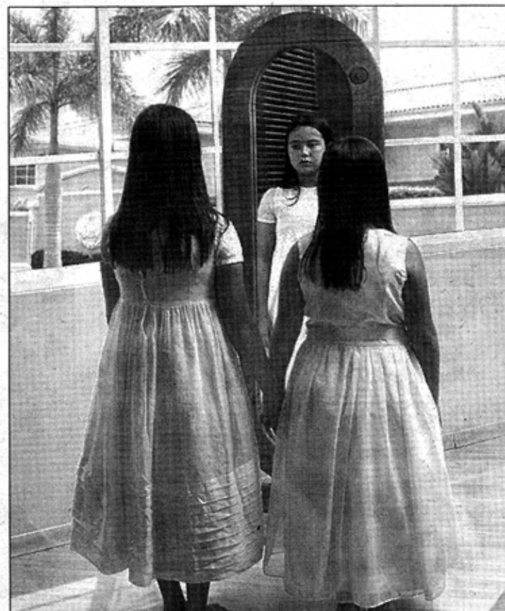
"American Girls and American Girl doll," by Rachel Mozman, digital cibachrome print.