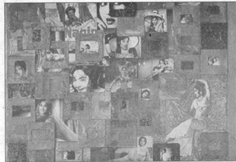
"Vyjayanthimala I," mixed media, by James Banta

to increase the general public's accessibility, awareness and appreciation of the contemporary arts in central New Jersey. For more information on SICA, visit www.sica.org .